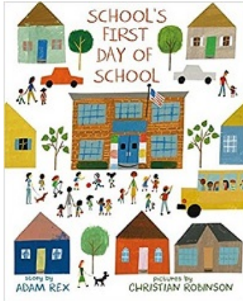
School's First Day of School , By Adam Rex, Illustrations by Christian Robinson

Here are a few of the ECC staff's picks to round out your early childhood library.