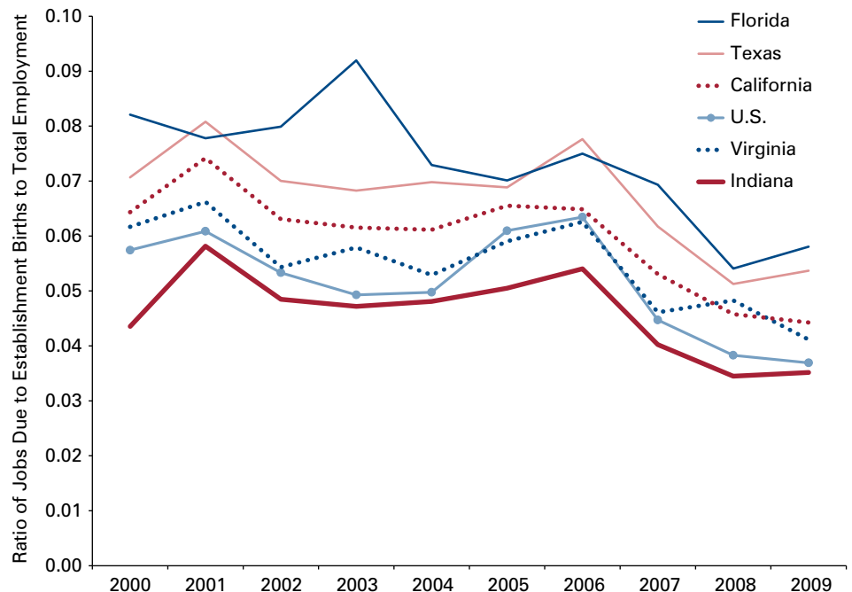
FIGURE 2: Births to Total Employment for the U.S., Indiana and Selected States, 2000 to 2009

The Great Recession was not as harsh for the education and health care/social assistance industries, at least based on the EB2D metric. The EB2D ratio for these never fell below 1.06, even in the teeth of the recession, and their CQs both averaged 1.21 from 2000 to 2009.