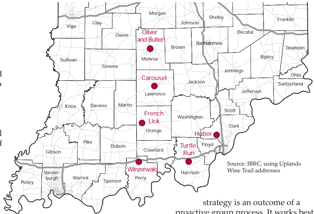
Figure 2 Uplands Wine Trail

the “power of clusters of interesting sites, activities, and events that can only be accomplished on a regional basis through cooperation.” 9 The Indiana Uplands Wine Trail, which stretches about 110 miles from Monroe County all the way south to the Ohio River, is a good example of regionalization (see Figure 2 ). The trail, which launched in mid 2004, consists of seven Indiana wineries, which tourists can travel between, staying in bed and breakfasts, eating at local restaurants, and shopping along the way.