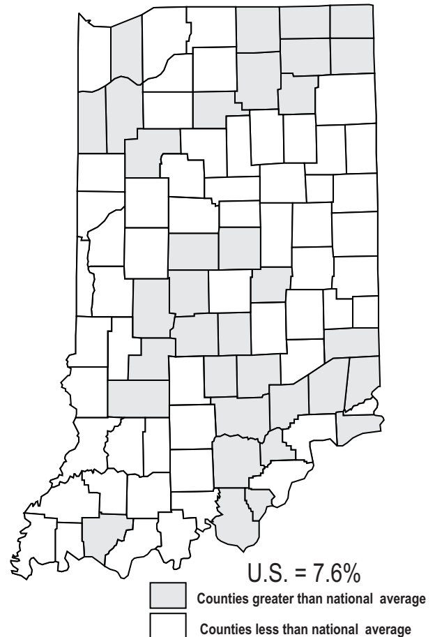
Indiana County Population Change Compared to National Average, 1990 to 1997