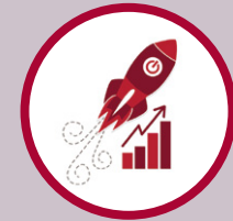
Entrepreneurs & Technology