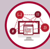
Women Who Code

For more details about each of the teams, visit womenandtech.indiana.edu/programs/student-alliance-groups .