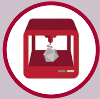
3D Printing & Design

Student alliance groups provide micro communities where students network, make new friends, and build technology awareness and skills in focused areas of common interest. Each of our 11 groups is led by three student interns who are responsible for designing and delivering a thread of programs for their theme.