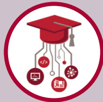
Graduate Women & Technology