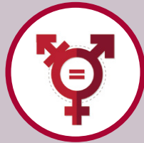
Allies for Equity