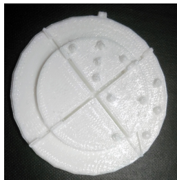
Figure 2: A sample of our 3D printed tactile prototype, showing a situation with 5 or more people in front of the user, two people nearby to the right, and three people further off to the right.