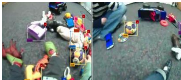
Figure 3: Example of cluttered training images, including multiple objects for detection, labeled and annotated with a bounding box.

The collected corpus of 2,008 infants' egocentric views were used to construct two different toy object training sets, as detailed in Table 1. Six of the objects were selected for our machine learning study: baby doll, ball, chair, bucket, boat, and duck (see Figure 1). One of the two training datasets had a uniform frequency distribution of object images, and the other was with a Zipf-like frequency distribution. There were a few reasons for only using six specific objects for the modeling framework. First, from the raw corpus of images, only 1,200 images included at least 1 of the 6 objects for detection in the scene. Second, Bounding boxes indicating the objects' location and label were annotated for the set of 6 objects intended for detection. Note that some images were removed from the corpus due to low image quality such as high blur. The corpus was augmented by 180-degree rotation and horizontally flipped, yielding a final corpus of about 3,000 images: 2400 split into training and validation and 600 for testing.