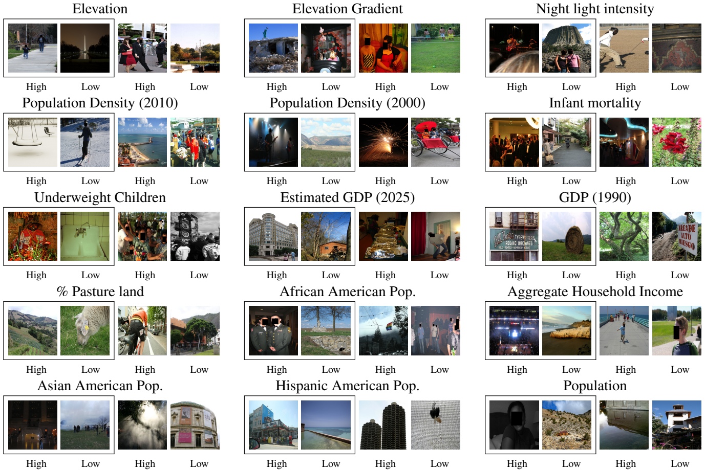
Figure 3: Some correctly- and incorrectly-classified images. For each attribute, we show a correctly-predicted high- and low-valued image inside the box, and an incorrectly-predicted high- and low-valued image outside the box to the right.

64% accuracy versus a 61.1% random baseline for urban development classification, while we achieve 73.6% accuracy on our similar “night light intensity” attribute versus 50%. Again, our tasks are very different so a direct comparison is not meaningful, but this at least suggests that our improvement over baseline is state-of-the-art.