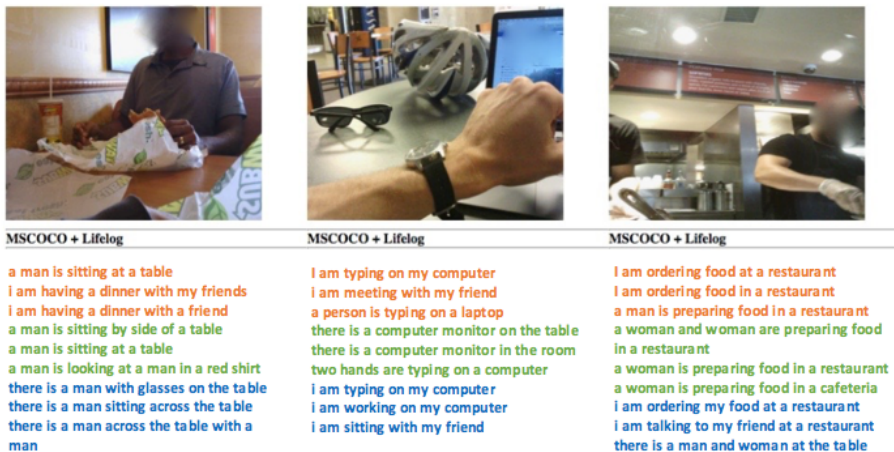
Fig. 1: Sample captions generated by models pre-trained with COCO and fine-tuned with lifelogging dataset. Three different colors show the top three predictions produced in three beam searches by applying the Diverse M-Solutions technique. Within each beam search, sentences tend to have similar structures and describe from similar perspective; between consecutive beam searches, structures and perspectives tend to be different.

b is called the beam size). However, we found that this existing technique did not work well for lifelogging sentences, because it produced very homogeneous sentences, even with a high beam size.