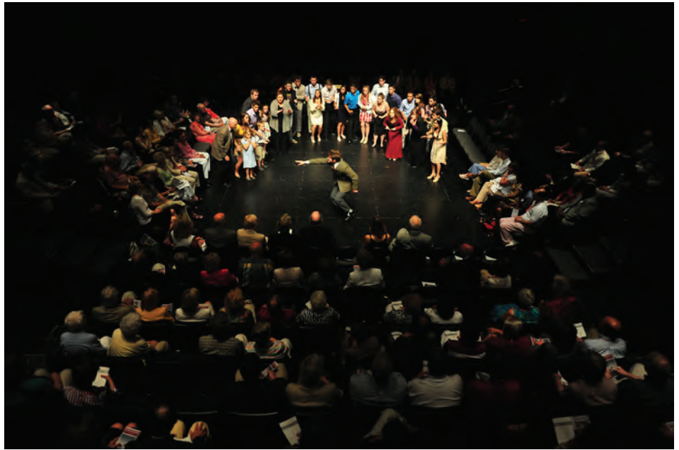
The cast of The Music Man closes the dedication ceremony in the Wells-Metz Theatre with a rousing "Ya Got Trouble."

We all can look forward to the fulfillment of that promise.