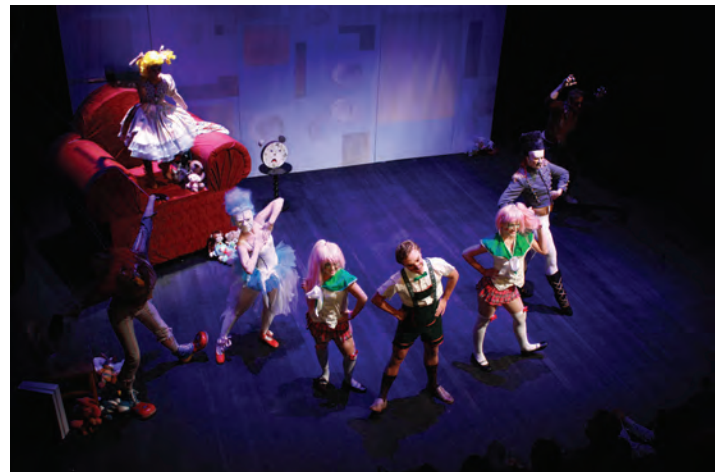
The renovated building includes a voice studio, two fully equipped lecture classrooms, a studio to teach acting for the camera, and many practice rooms for scene study and vocal work. Above, the University Players, the department's undergraduate production troupe, rehearses and performs in the new Studio Theatre. Right, Professor Adam Noble teaches in the new movement studio.