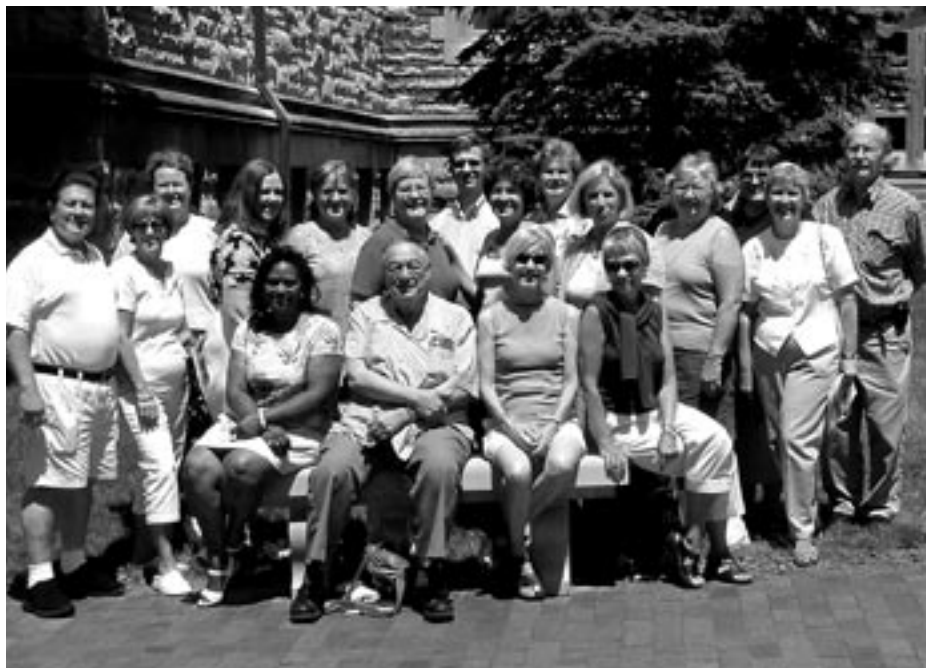
Peru Group 1965 gathered in Bloomington to celebrate their 40th reunion. For a complete list of who they are and what they've been doing, see our department Web site.

They also experienced what it felt like to live under martial law, when guerrilla warfare exploded in the city. They learned to accept as normal the armed guards who