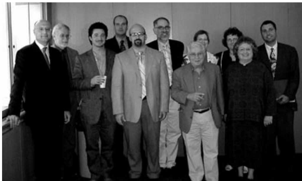
Don Quixote Symposium presenters and organizers during a reception in the Lilly Library