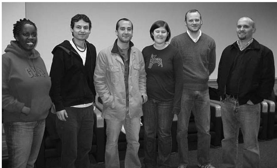
Fuel the body, fuel the brain — A group of graduate students take a lunch break during a long day of MA examinations. It’s a department tradition for fellow graduate students to provide a meal in support of their colleagues’ efforts.