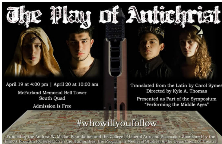
A flyer for one of the 2013 pilot performances.

der to recognize the many forms of performance that took place in medieval cultures (including religious and political rituals, musical and visual art forms, dramatic and lyrical performances, re-performance or adaptation, and reported performances), as well as the influence of medieval performances on later traditions. To draft proposals for our committees, the IU members of the planning committees have conferred with colleagues in the College of Arts and Sciences and Jacobs School of Music and are working on proposals to host three conferences that will combine performances and scholarly papers during the course of the multi-year grant. Each proposal will be made through a different planning committee, but we hope that each performance/conference will provide opportunities for collaboration with a wide range of faculty colleagues and students, as well as professional performers.