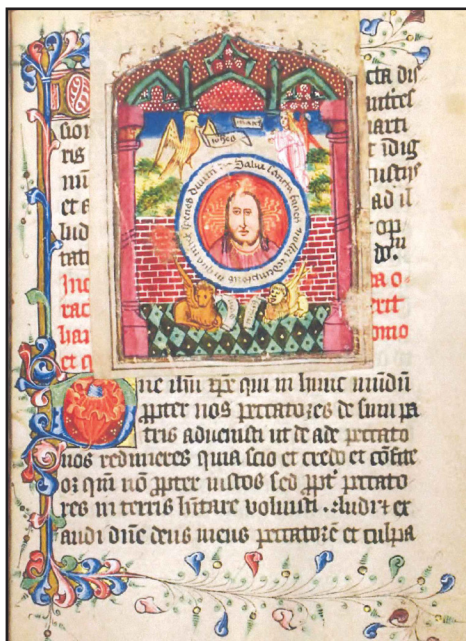
A page from the "Pavement Hours" (York Minster XVL.K.6). The illumination containing the face of Christ is sewn on to the top of the page, so that a reader could still flip it up to read the text beneath.

With such a momentous semester behind us, it is almost sad to leave it behind! But we look forward to continuing to offer resources and events for medievalists across campus in the Fall, and we look forward to seeing you all in September!