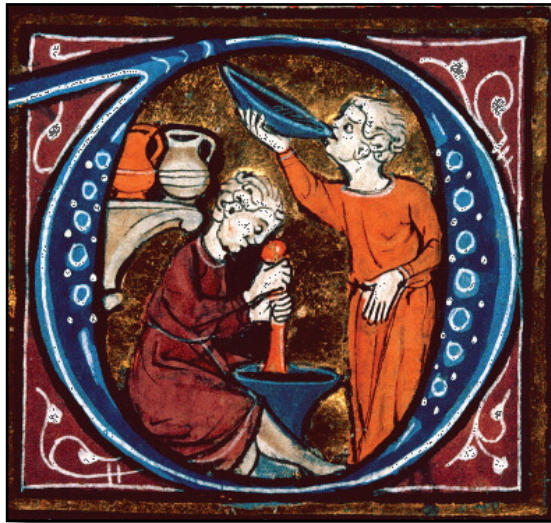
An illustration from Avicenna's Canon

Constantine the African's Pantegni describes three kinds of spirit: natural, vital, and animal. The first originates in the liver and moves through the veins; the second originates in the heart and moves through the arteries; and the third originates in the brain and moves through the