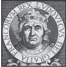
Louis VI, “the Fat,” subject of Suger’s biography