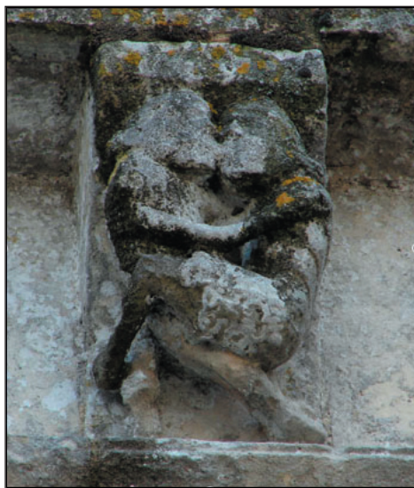
Corbel Sculpture from Perignac