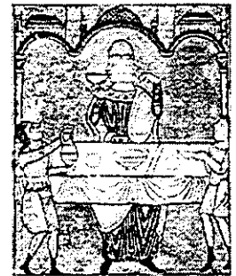
Koninklijke Bibliotheek 76 F13, f. 1v.