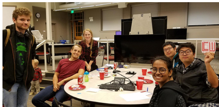
Some of the incoming students took 2nd place in the LCIU's students-vs-faculty Trivia night.