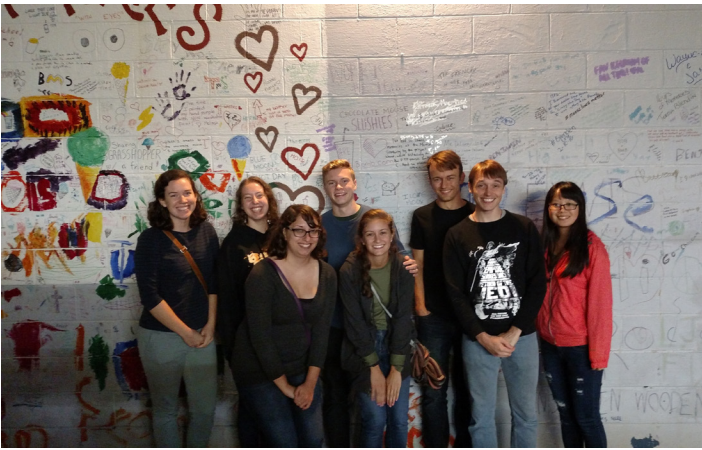
Graduate students socialize over ice cream at the iconic Chocolate Moose.