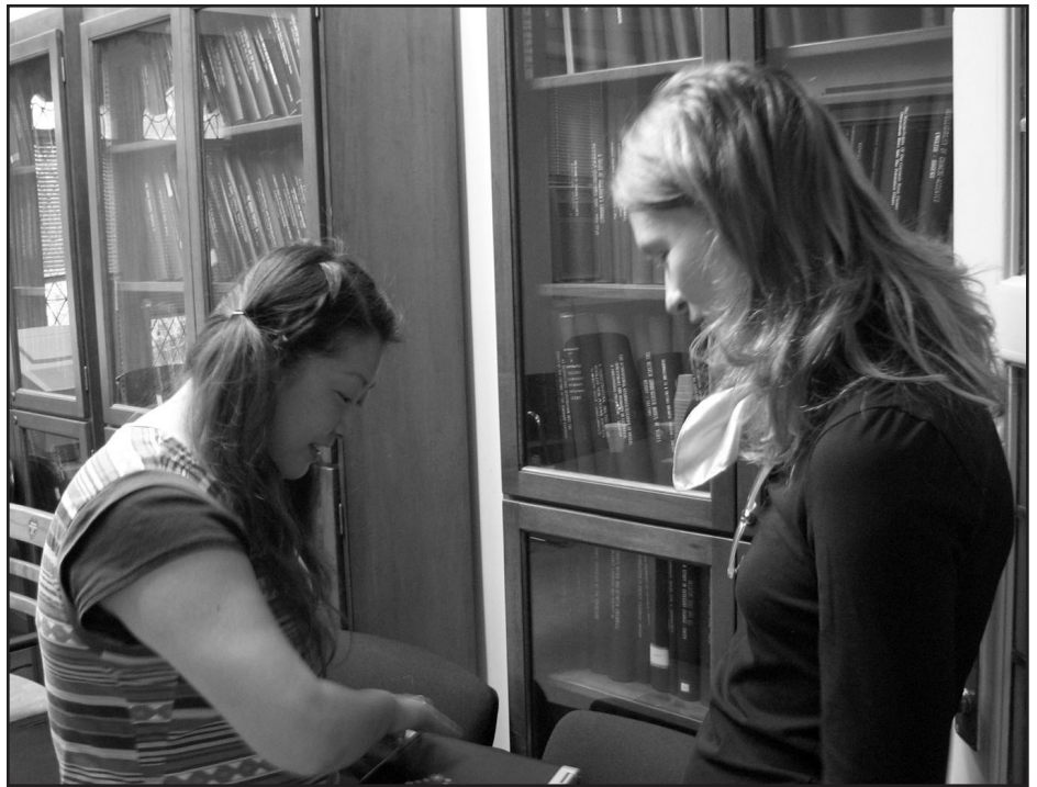
Students socializing with the departmental dissertations