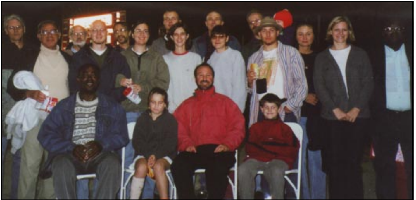
A good time was had by all when the IU Department of Linguistics got together to support IU Men's Soccer on Sept. 20!