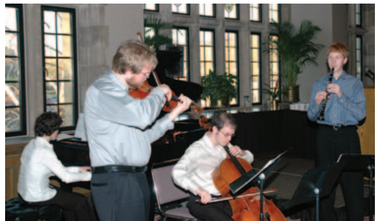
Kolot Ensemble performs at 2008 JS student-faculty dinner.

Fall 2008 events will include: the first Hebrew Table on Tuesday, September 9 at 5:30; Meet the JS Faculty at dinner on Monday, September 15; and, the JS Fall Welcome Dessert on Thursday, September 25, 4:30-6:00 p.m.