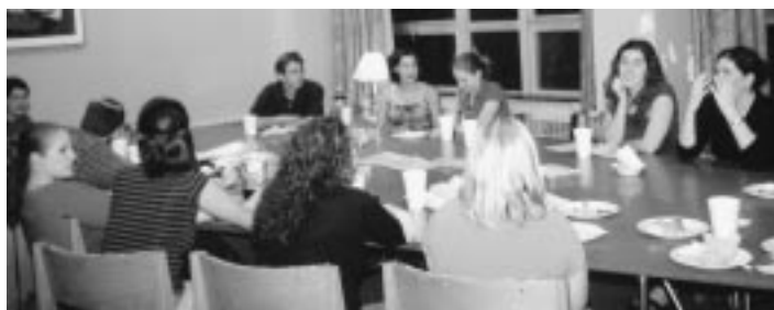
JS FIGs students dine with JS faculty and JSSA officers

For information about how to apply for these scholarships, high school seniors can view details about the application procedure at http://www.indiana.edu/~jsgp/glazerscholarship.htm . The application deadline for Fall 2005 is Friday, March 4, 2005 .