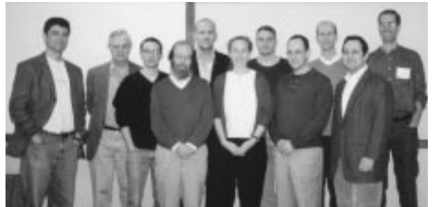
Levinas and Wittgenstein conference participants

seminar on Judaism and the Jews. The New Institute offers community members an opportunity to engage in intensive study of major issues in Jewish history, thought, and culture with members of the JSP faculty. The next Borns JSP New Institute in Spring 2006 will focus on Jews and the arts.