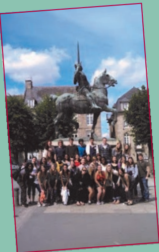
Excursion to Dinan and St. Malo