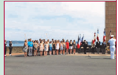
4th of July Celebration— American War Memorial

To celebrate the fourth of July, we sang (after much practice) the French and American anthems at the American war monument. During the official event, flowers were placed, followed by a salute from the French navy and a moment of silence. We even made it into two newspapers the next day.