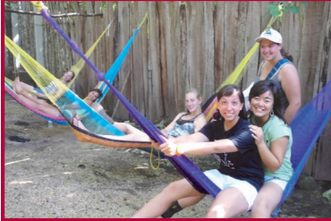
Hammock Fun near Tulum