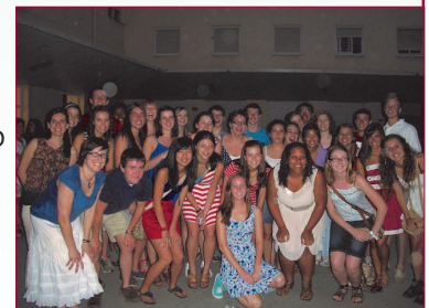
Fourth of July—Happiness