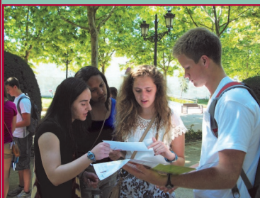
Treasure Hunt in the City