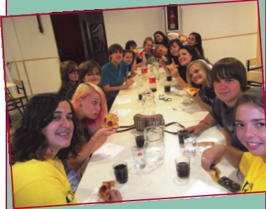
Pizza Lunch Fun

Students found creative ways to replicate important figures and events in American history — some were even cast as horses to help bring certain battle scenes to life. A very special but fitting surprise ending to the evening happened when a family in the park joined our group and played flamenco music on their guitar while students and host families gave their own (hilarious) version of flamenco dancing...an unforgettable Spanish touch to our traditional American holiday.