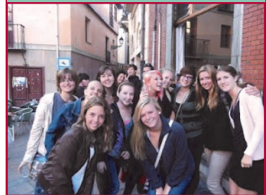
Night Out in León