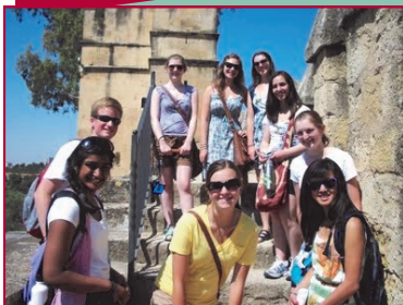
On Excursion in Andulucía