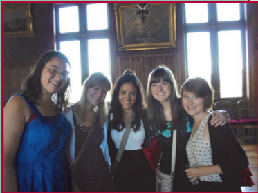
Reception at the Mairie (Mayor)