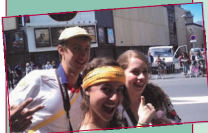
At the Tour de France