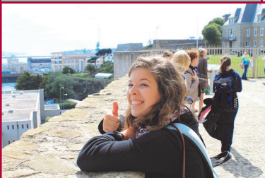
Château de Brest—View of the City