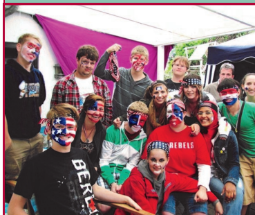
4th of July in Krefeld