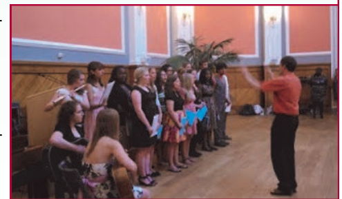
Presentation for the mayor of St. Briec