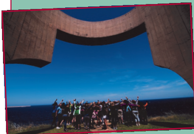
Fieldtrip Cimadevilla in Gijón