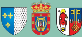
Brest Ciudad Real Krefeld