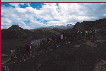
Los Picos de Europa