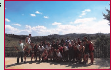
Excursion to Toledo

In 2011 we also changed the line-up for excursions. As usual, we visited the lovely cities of Segovia, Oviedo and Gijón, but replaced a trip to Salamanca with Burgos. Students enjoyed the marvels of the university, cathedral, Plaza Mayor, and other notable spots around town. Staff also offered various optional trips and activities.