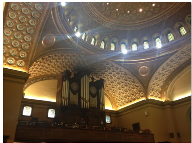
The C.B. Fisk, Opus 79 in First Presbyterian Church, Charleston, WV