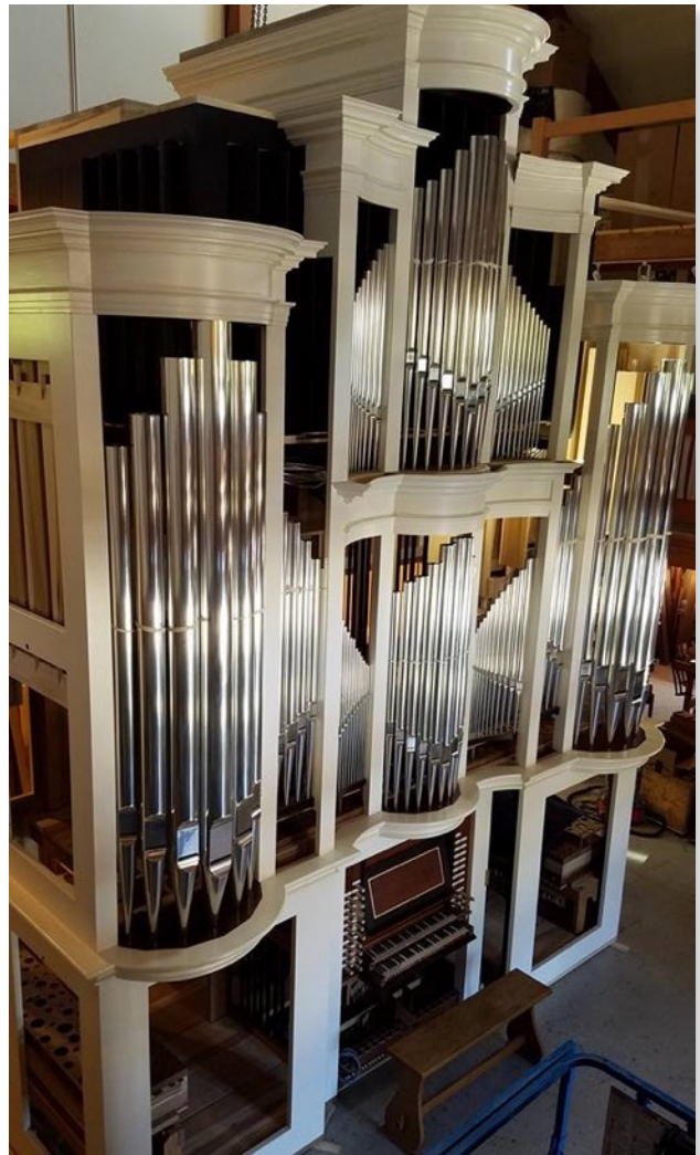
The new Paul Fritts organ (under construction) that is set to arrive at First Presbyterian Church on October 22