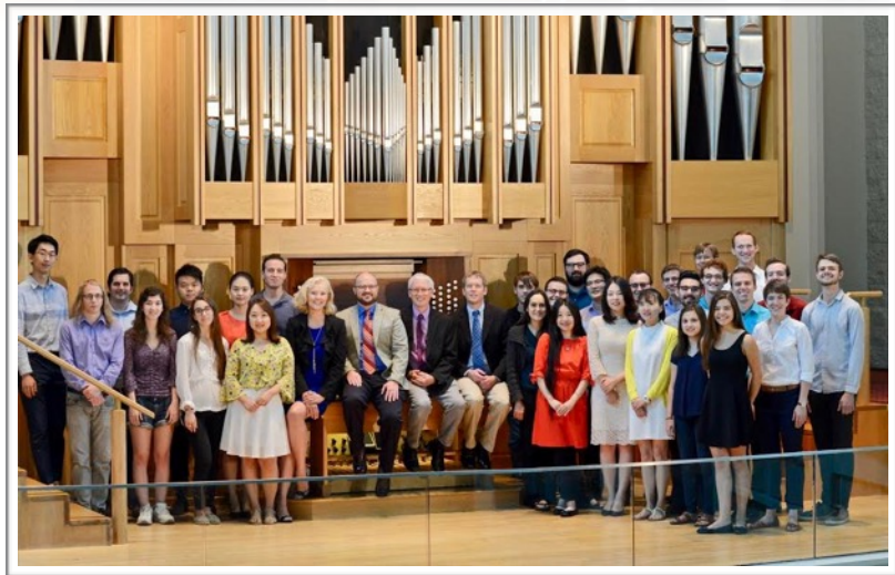
2017-2018 Indiana University Organ Department