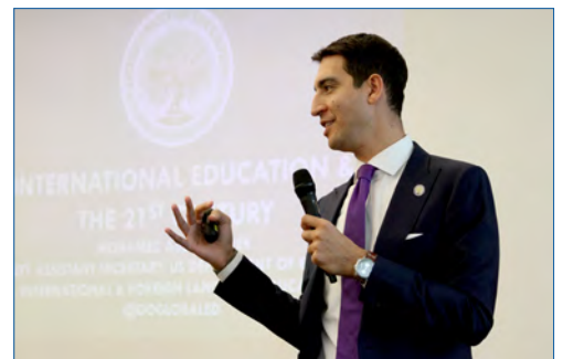
ICCI participants during discussion sessions and cultural night