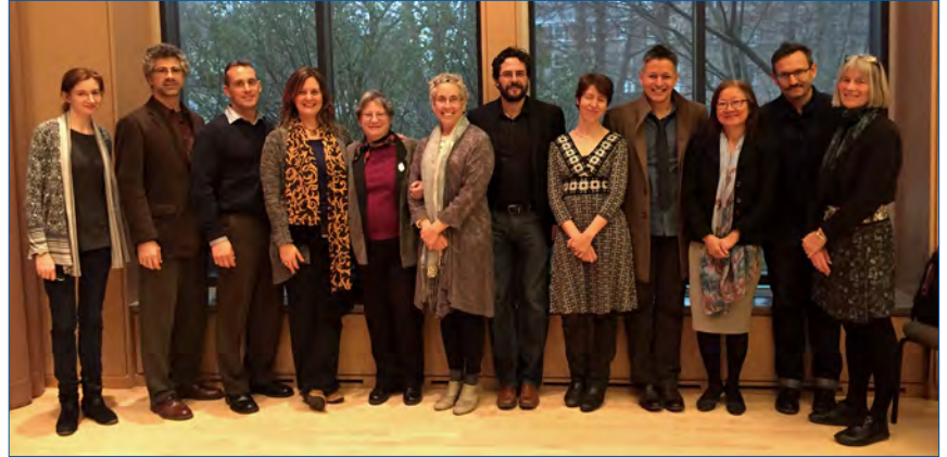
Participants in the 2016 Ambiguous Geographies Symposium