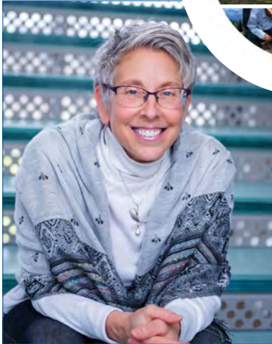
Director, Center for the Study of Global Change

Assistant Dean for International Education and Global Initiatives, School of Global and International Studies, Indiana University