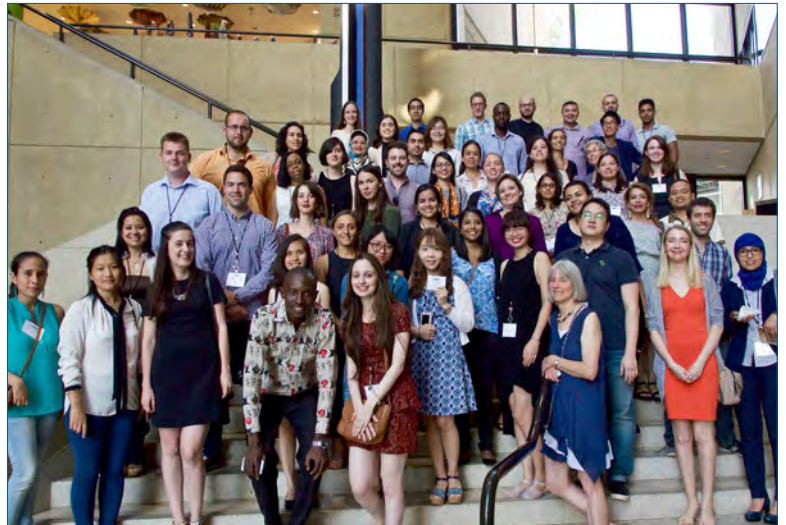
Fulbright Gateway Orientation closing dinner at the IU Eskenazi Art Museum

Having hosted a successful Fulbright Gateway Orientation in August 2015, the Global Center was asked to welcome a new group of international Fulbright graduate students during the week of August 1, 2016. The group of 55 students from 42 countries attended workshops on U.S. cross-cultural understanding, U.S. academic culture, and American politics, among other topics. They also enjoyed such American activities as a picnic in Bryan Park and a trip to Spring Mill State Park. Based on student feedback, this year's Gateway was again a success. Said one orientation participant: "It was the perfect first contact with the U.S. It is a huge change, moving away from home to a different country with a different language, culture and system. The Gateway helped me [to make] the transition and made me feel welcome to the US. Thank you!"