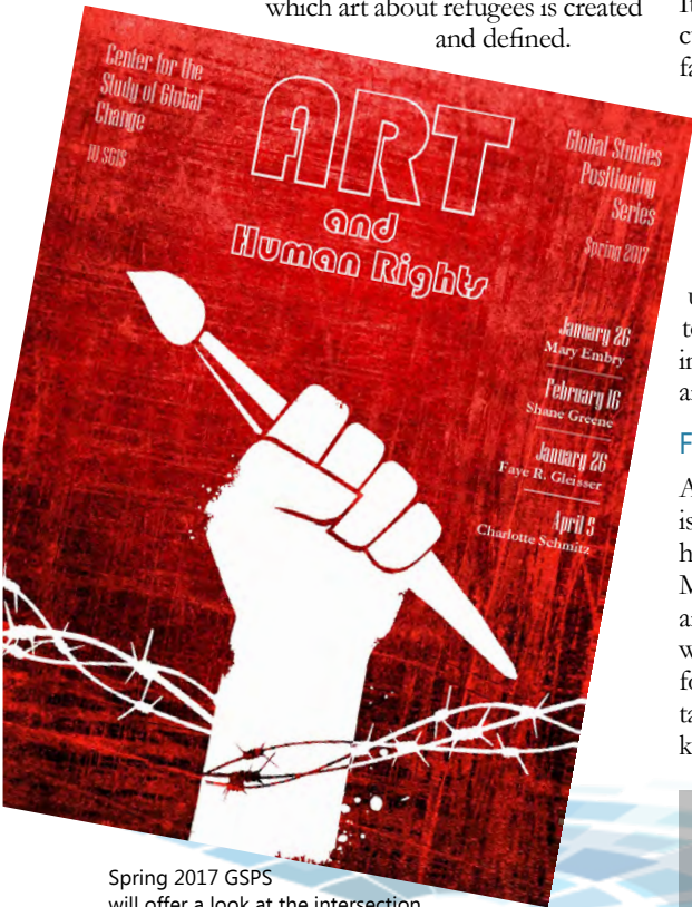
Spring 2017 GSPS will offer a look at the intersection of Human Rights and Art

2017 will mark the Institute for Curriculum and Campus Internationalization's (ICCI) 7th year. It facilitates the internationalization of campus, curricula, and courses to better prepare students, faculty, and staff to be effective scholars, practitioners, and citizens of the 21st century. 2017 ICCI will be held on May 21-24.