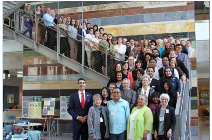
ICCI 2016 participants and staff

ICCI 2017 will take place May 21-24. Inquires can be sent to icci@indiana.edu . Registration will begin January 3.