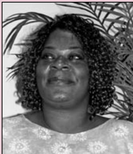
Brown systems, utilizing ground, airborne, satellite, and modeling platforms.

Brown's publications include surface-atmosphere exchange dynamics of mass and energy in agricultural, arctic, boreal, and semiarid forest eco-