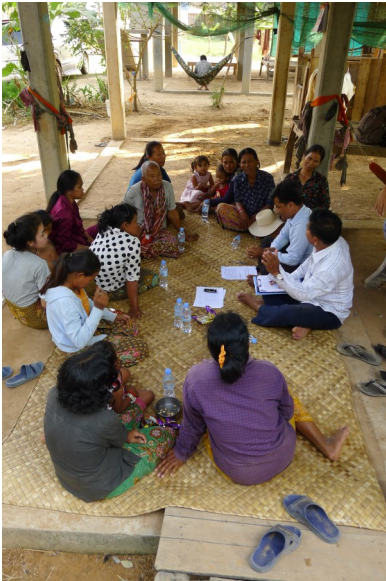
Photograph of focus group with Cambodian women farmers