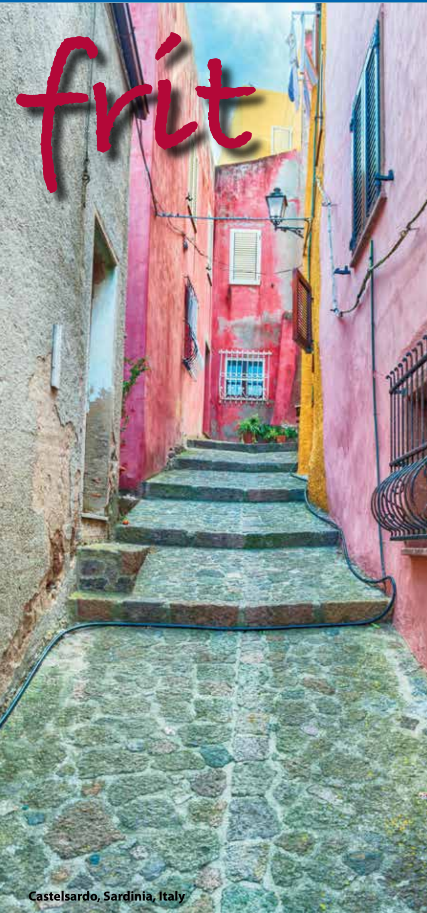
Castelsardo, Sardinia, Italy