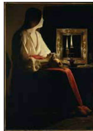
Georges de la Tour, The Penitent Magdalen , 1640 (Metropolitan Museum of Art, New York)