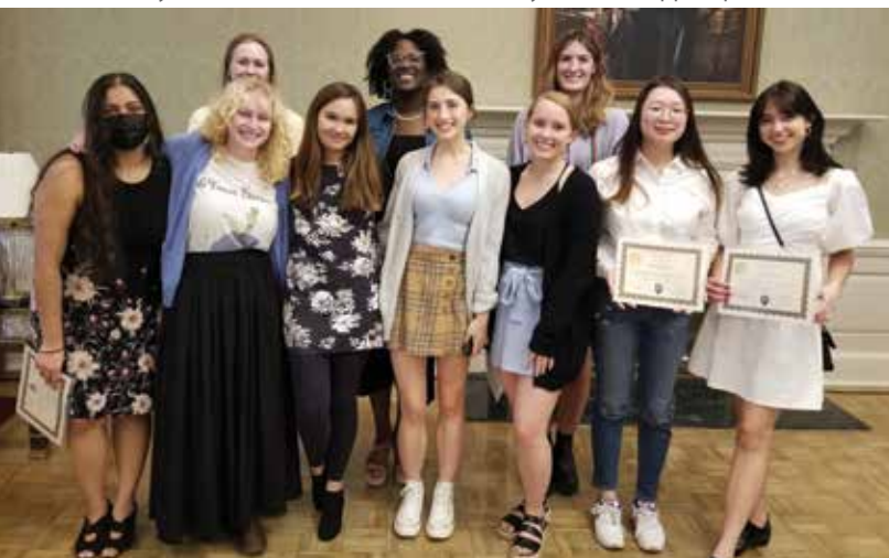
6 ~ frit summer 2022