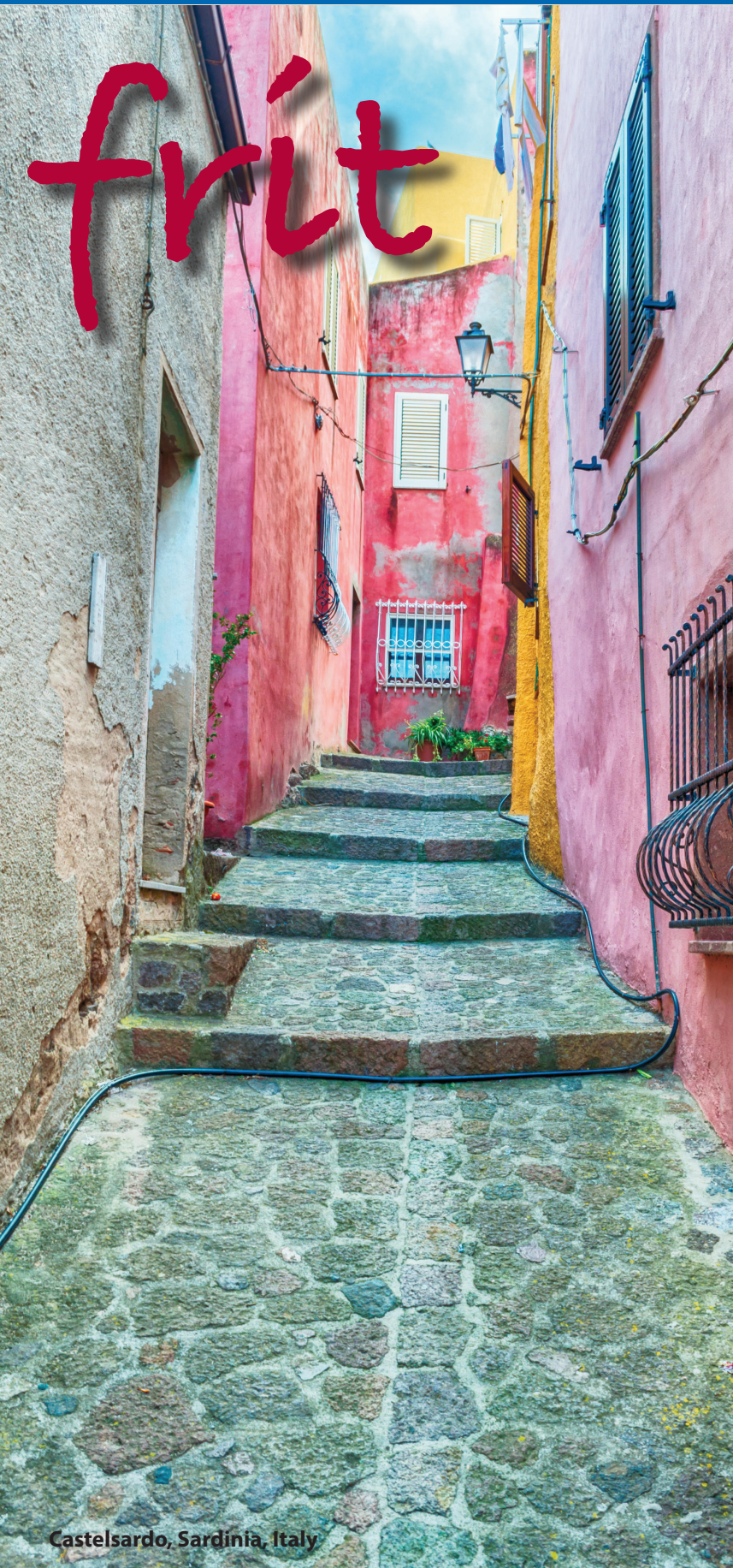
Castelsardo, Sardinia, Italy