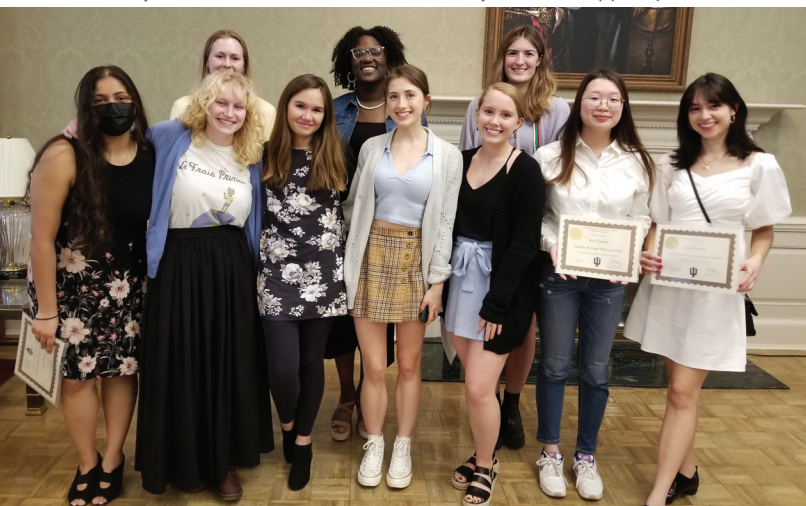
6 ~ frit summer 2022