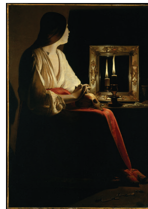
Georges de la Tour, The Penitent Magdalen , 1640 (Metropolitan Museum of Art, New York)