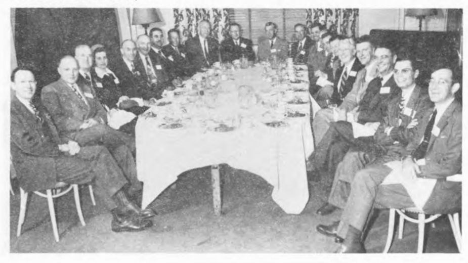
Geology Alumni meeting in Denver, Colorado at AAPG meeting either 1948 or 1949.