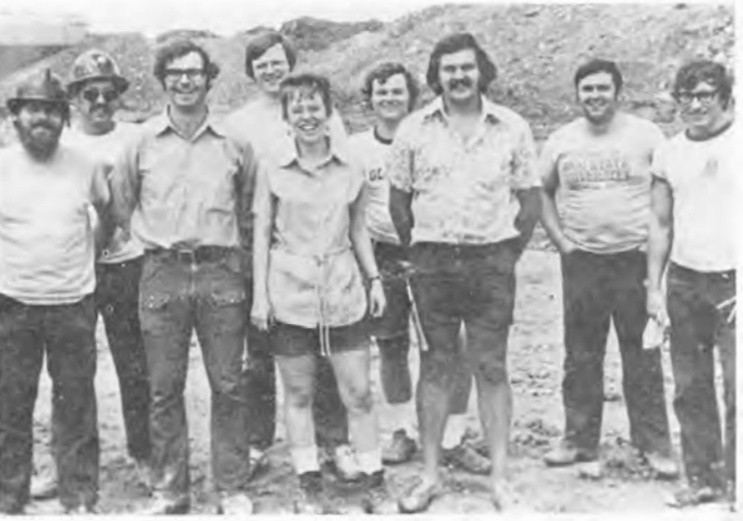
T311 class, 1974, second summer session.