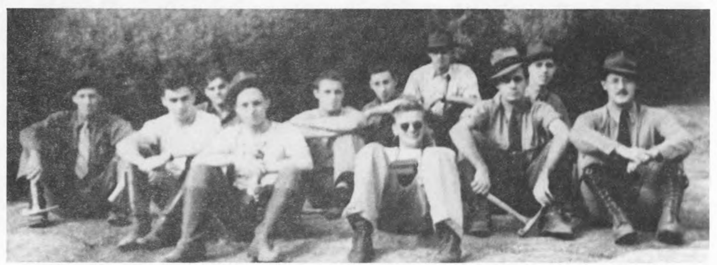
IU mineralogy class of 1940 at Elephant Rocks, Graniteville, Missouri (photo by Preston McGrain).