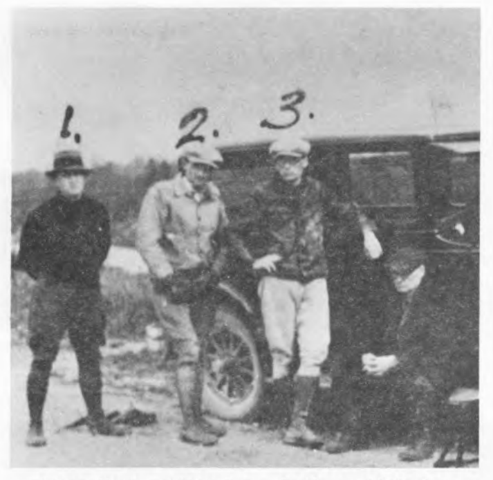
Tarr Hole, Silurian, Indiana 1927.