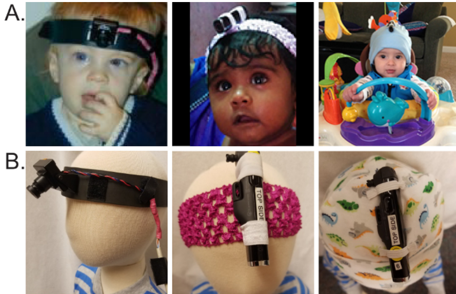
Figure 2: Examples of head-mounted cameras and their attachments. (A) Infants and toddlers wearing head-mounted cameras at home and in the lab. (B) Examples of ways to attach head cameras to headbands (left, middle) and hats (right). Please click here to view a larger version of this figure.