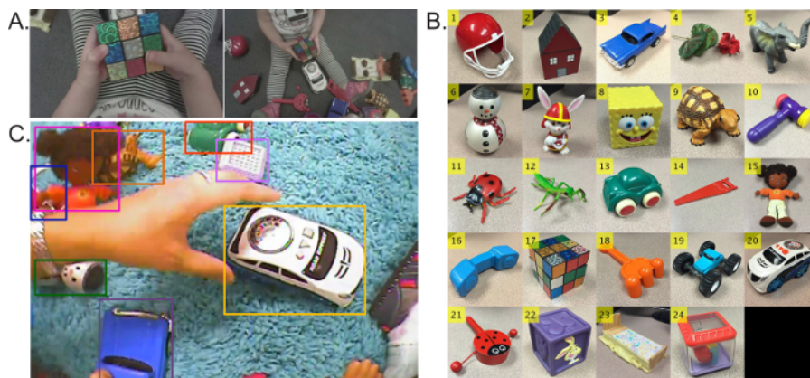
Figure 3: The 24 toys used in the representative method. (A, left) Representative frame from the head camera of a child illustrating a smaller number of objects in view and at visually larger sizes. (A, right) A representative frame from the head camera of a parent illustrating their typical view: many objects at visually smaller sizes. (B) Toys are consistent in size, ranging from 2-7 inches on the longest dimension, and between 2-3 inches on the shorter dimensions. (C) Boxes are drawn around each toy, or part of toy that is visible and identifiable, using an in-house graphical user interface. Please click here to view a larger version of this figure.