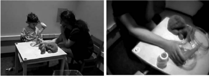
FIGURE 3 A head camera view (a) and simultaneous third camera view (b).

another and how social partners may direct and guide attention in those contexts. It seems possible in light of these data that tasks involving the active manipulation and manual movement of objects of interest may present the learner with a different kind of attentional task—and potentially different kinds of solutions—than ones involving the more passive viewing of objects (see Kidwell & Zimmerman, 2007, for relevant evidence). Indeed, although much research on joint attention has focused on eye-gaze following (see MacPherson & Moore, 2007, for review), there is increasing interest in the whole-body nature of attentional interactions in social settings (e.g., Kidwell & Zimmerman, 2007; Lindblom & Ziemke, 2006; Moll & Tomasello, 2007). Finally, the finding that there is typically one dominant object in the head-camera image also boosts confidence that the head-camera image is capturing child-relevant aspects of the scene.