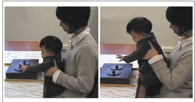
Fig. 3. An infant sitting for an A trial (left) and standing for a B trial (right). This change in posture causes younger infants to search as 12-month-old infants do (see text for details).

shifting the posture of the infant [24]. An infant who sat during the A trials would then be stood up, as shown in Fig. 3, to watch the hiding event at B, during the delay and during the search. This posture shift causes even 8- and 10-month-old infants to search correctly, just like 12-month-olds. In another experiment, we changed the similarity of reaches on A and B trials by putting on and taking off wrist weights [25]. Infants who reached with 'heavy' arms on A trials but 'light' ones on B trials (and vice versa) did not make the error, again performing as if they were 2–3 months older. These results suggest that the relevant memories are in the language of the body and close to the sensory surface. In addition, they underscore the highly decentralized nature of error: the relevant causes include the covers on the table, the hiding event, the delay, the past activity of the infant and the feel of the body of the infant.