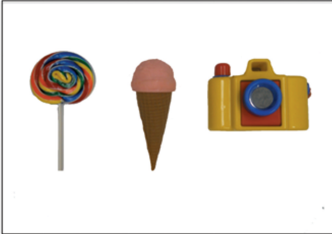
(a) Rich typical instances