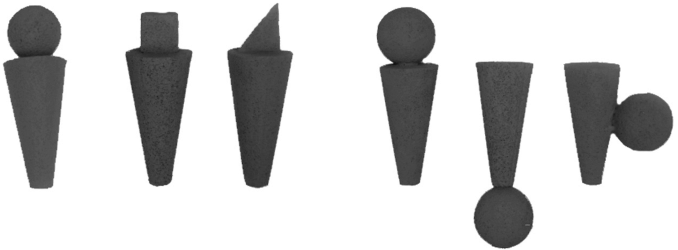
(A) Part shape test set