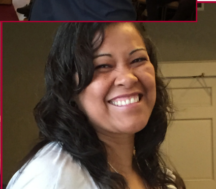
Friends and family members snapping photos at the awards ceremony