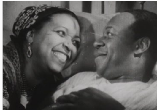
(Screenshots of Waters with Mantan Moreland from a 16mm print of Cabin in the Sky in the BFCA General Collection.)