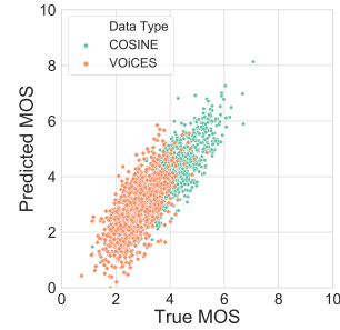
Figure 3: Correlation between the true MOS of the test stimuli and corresponding predicted MOS on COSINE (orange) and VOICES (green) corpora.

When comparing to recent data-driven approaches, the proposed model achieves the highest performance in terms of both prediction error and the correlations with the ground-truth MOS, except for SRCC of the DNN model on VOICES data ( \gamma = 0.86 ). The proposed model, however, achieves higher correlations, \rho = 0.91 and \gamma = 0.90 than the \rho = 0.85 and \gamma = 0.86 of the DNN model on COSINE data. The PCC of the proposed model also far exceeds the 0.75 of AutoMOS and 0.82 of Quality-Net. Similar trends occur on VOICES data as well. pBLSTM+Attn improves the PCC to 0.88, compared to Auto-