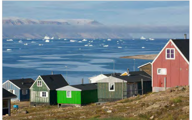
Coastal town in Greenland