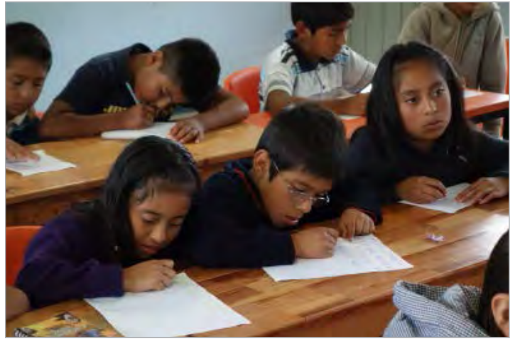
Totontepecano children learning to write Ayöök