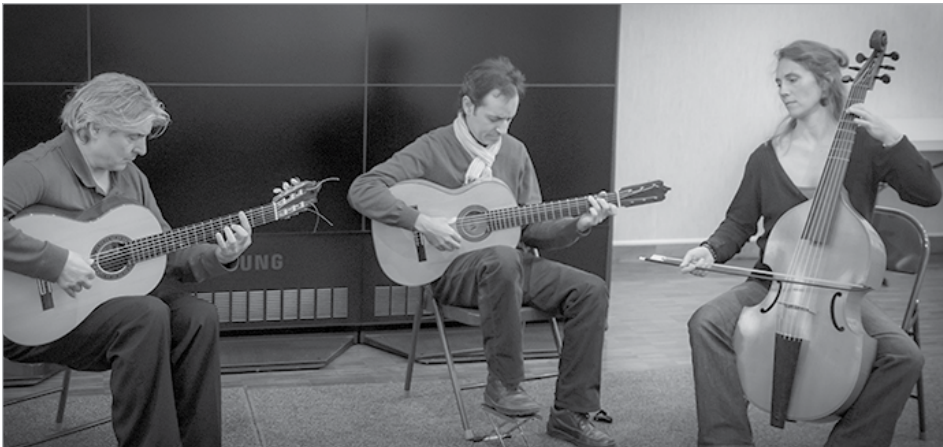
Eterno Juan Ramón Jiménez - Spanish Music and Poetry