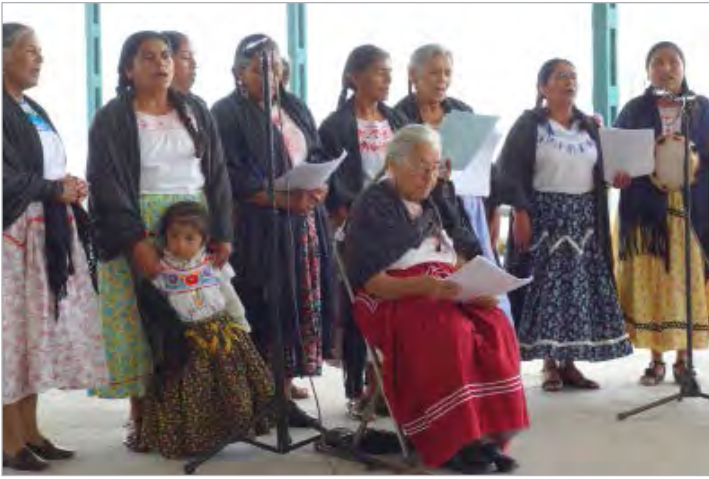
Totontepec women's choir, performing bilingual songs in Spanish and Ayöök