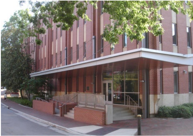
Thomas Hall at North Carolina State University