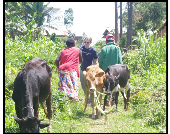
Ebarb greets a passerby on his way to visit a new hospital construction in Mahanga village.

In my nine months there, I carried out extensive studies of the verbal tone systems of each of the six dialects. One of the primary research goals is to further documentation of the rich diversity of Luhya verbal tone systems. Such documentation will make possible gains in the understanding of what gave rise to such diversity. In addition, I collected a modest vocabulary (600-800 words) and a number of short narratives written in and translated from several of the same dialects to document aspects of the culture unique to each dialect group. During my trip, I also had the opportunity to present some results of the project and a brief lecture on the methodology I used in carrying out my study at Moi University's main campus in Eldoret.