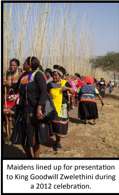
Maidens lined up for presentation to King Goodwill Zwelethini during a 2012 celebration.

From June 2012-June 2013, I conducted dissertation fieldwork in South Africa, funded by the Andrew W. Mellon Foundation and the Institute for International Education. While there, I split my time between living in Bloemfontein, Free State and Durban, KwaZulu-Natal, and conducted interviews with primary language Afrikaans-speakers in the former, and primary language Zulu-speakers in the latter. My dissertation project looks at the dynamics of nationalist sentiments in post-conflict countries. Getting the opportunity to speak first-hand to people who lived through the South African transition to majority rule and record their experiences with the process of reconciliation was an incredibly valuable experience. I also took the opportunity to attend cultural events, like Umkhosi Womhlanga (the Reed Dance, sponsored by the Zulu royal house to celebrate the young women of the Zulu Nation) and Geloftedag (the Day of the Vow, a celebration of Afrikaans history and the Voortrekkers).