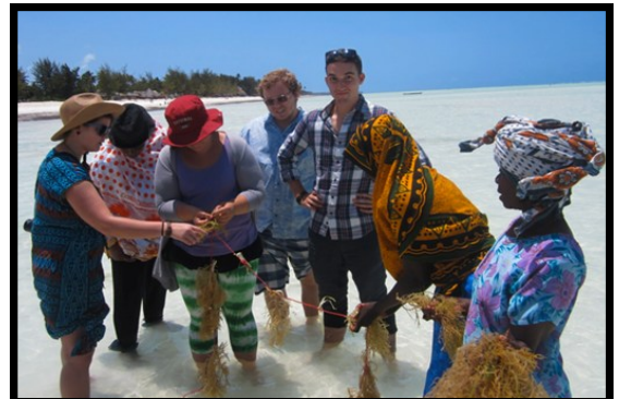
Students from the Swahili Flagship Program visit a seaweed farm in Zanzibar.

Over the summer, six students participated in an 8-week summer program in Zanzibar through the Flagship Program. They will return to IU this fall and spend their 2014-15 academic year in Tanzania.