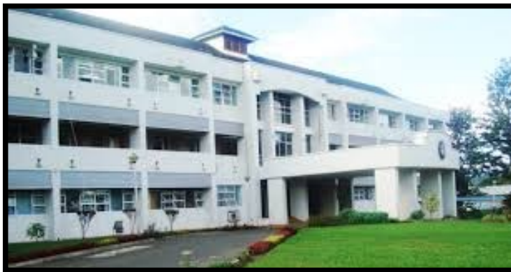
The University of Malawi.

With the support of a Skomp summer feasibility study award and a graduate student research award from the Center for Research on Race and Ethnicity in Society, I traveled to Malawi to conduct six weeks of fieldwork for my dissertation project. Since 2009 I have been working to examine the intersections of the state, its education policies and university students' lived experiences in Malawi. This summer was a continuation of the preliminary phase of my research.