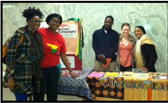
Hosts at the African languages table in Ballantine Hall as part of Discover Languages Month .