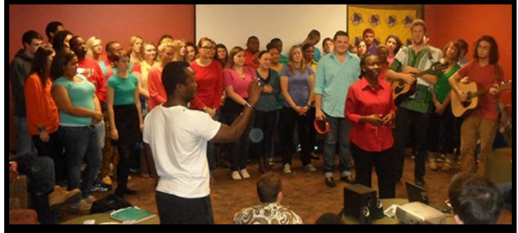
Swahili students sing a song for attendees at the first of two African languages festivals.

In February, African language instructors and volunteer students participated in 'Discover Languages Month' by hosting a day-long exhibit at Ballantine Hall. It was a great occasion to engage with students and share information