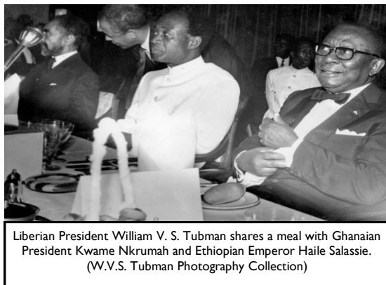
Liberian President William V. S. Tubman shares a meal with Ghanaian President Kwame Nkrumah and Ethiopian Emperor Haile Selassie.