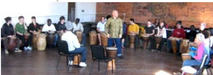
Woma teaching drumming at a workshop during Saakumu's visit. ASP.