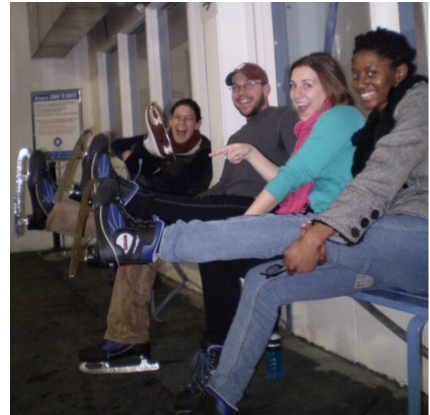
GSAS ice skating event.