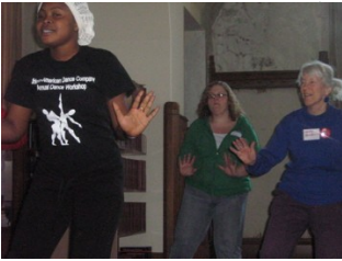
Teachers learning Ghanaian dance during Spring Workshop.