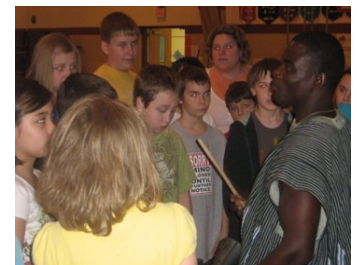
Saakumu drummer talking with Poston Road (Martinsville) Elem. Students.